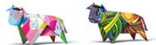
HP SmartStream Mosaic one-of-a-kind designs.