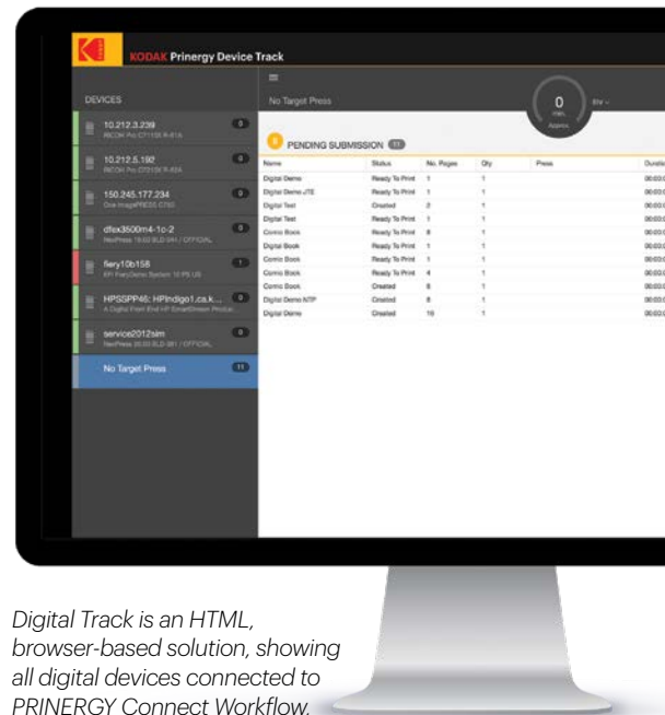
Digital Track is an HTML, browser-based solution, showing all digital devices connected to PRINERGY Connect Workflow, including KODAK CTP devices

Quickly adapt to changing business requirements by leveraging an open platform with broad connectivity and flexibility to scale.